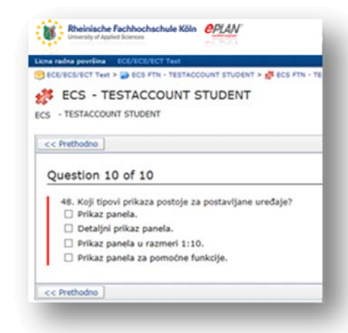
Fig. 3. Example of the exam question in Serbian language

The log-in mask is available in different languages, depending on the language of examination. Based on it, theoretical online examination has been developed. Practical part of the test is, in the case of EPLAN Certified Student examination, done on-site, by our local licenced partners. One example of the exam question in Serbian language is presented in Fig. 3: