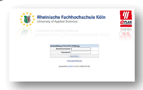
Fig. 2. Online examination portal based on ILIAS Learning Management System

Fachhochschule Köln uninterruptedly develop examination questions, in all international languages, and not only in the English or German language that are used for national EPLAN Certified examinations. This huge multidimensional task can be professionally solved, only if collaboration partners, Rheinische Fachhochschule and EPLAN Company agree to give simultaneous efforts and to develop strong interfaces for data-exchanges. Defining the list of examinations questions requires a data exchange that is described as an XML file. This allows also direct definitions of the questions type as e.g. multiple-choice questions with single or multiple answers, free text questions, java applet combined questions and answers. In this way, well-organized work is achievable and technical basis for effective progress of the whole certification program is attainable. Based on the ILIAS learning management systems, the online-examination portal for EPLAN Certified Student (ECS) exam is presented in Fig. 2: